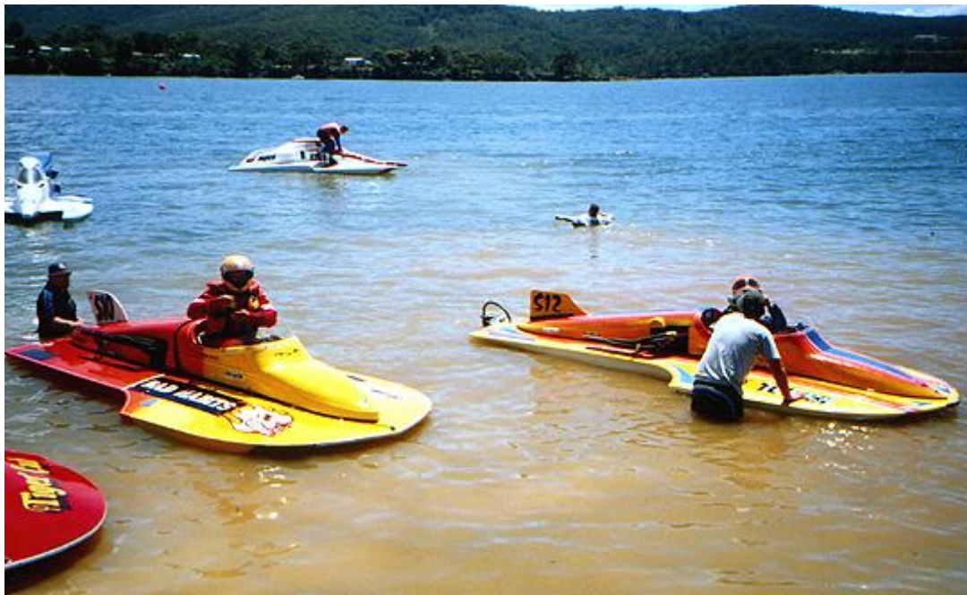
Class: 1.6 Light Hydro Background: TWIN CAM - Darren Penington - GDBC Left: BAD HABITS Right: LI'L TERRA Owner: Phil Norrish - Driver: Tash Heffernan