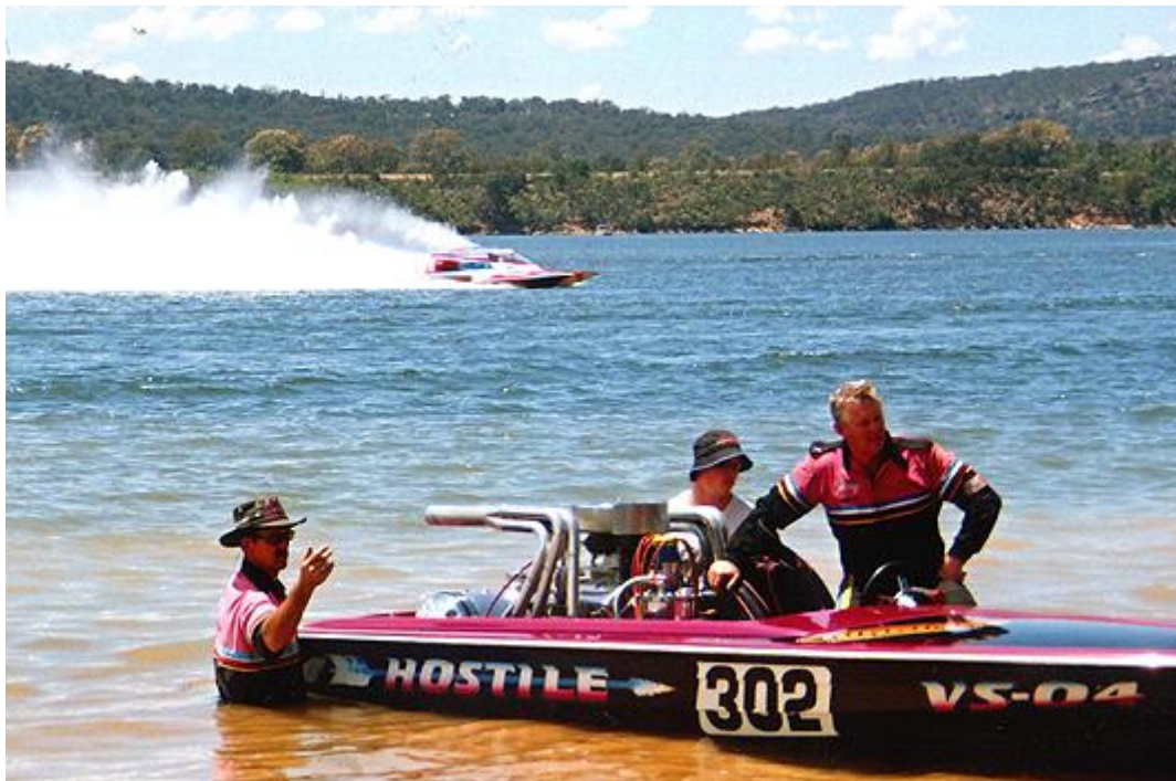
HOSTILE with GP-7 DRAGULA RACING in background