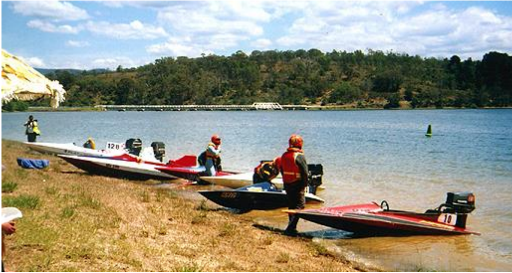
OUTBOARDS: 25 HP