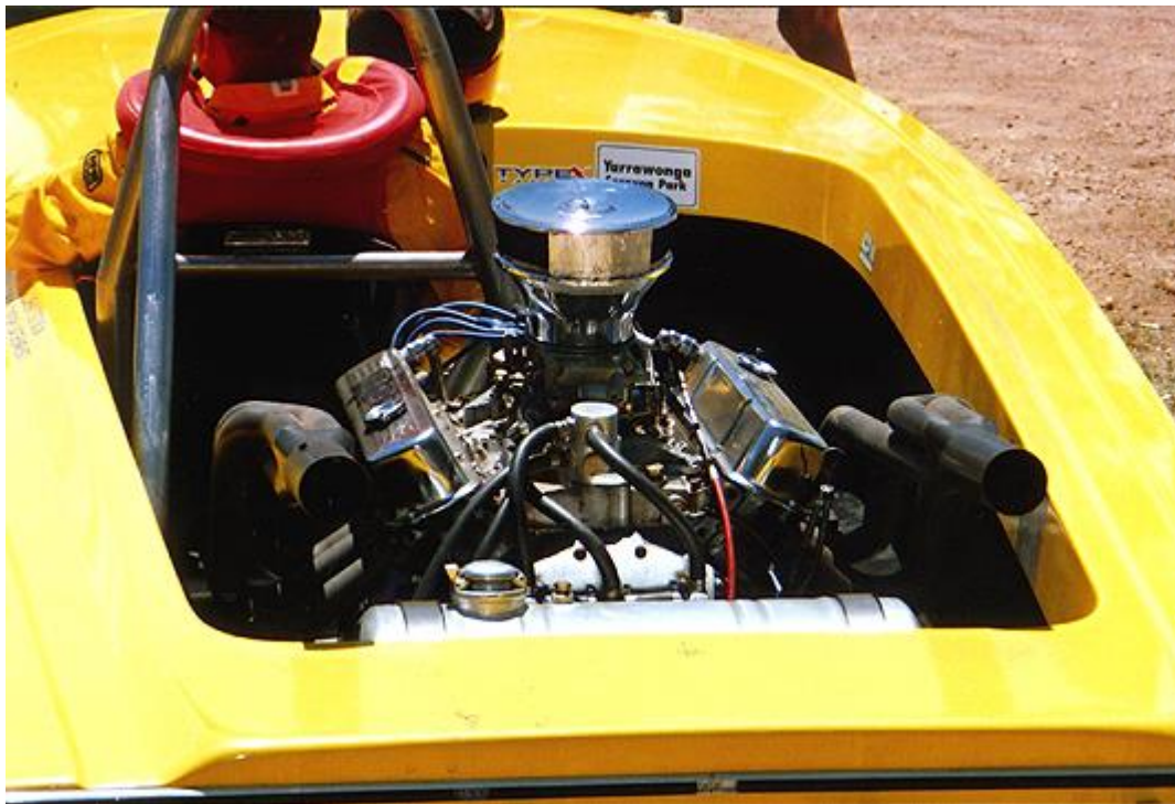
CHEETAH: 4.2 Displacement Shane Pangrazzio