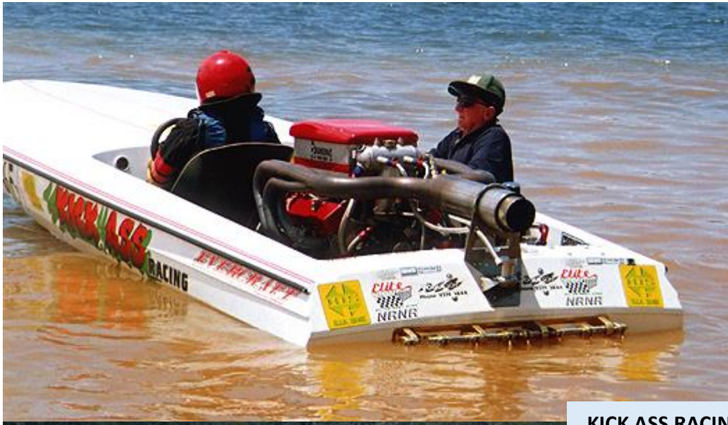
KICK ASS RACING