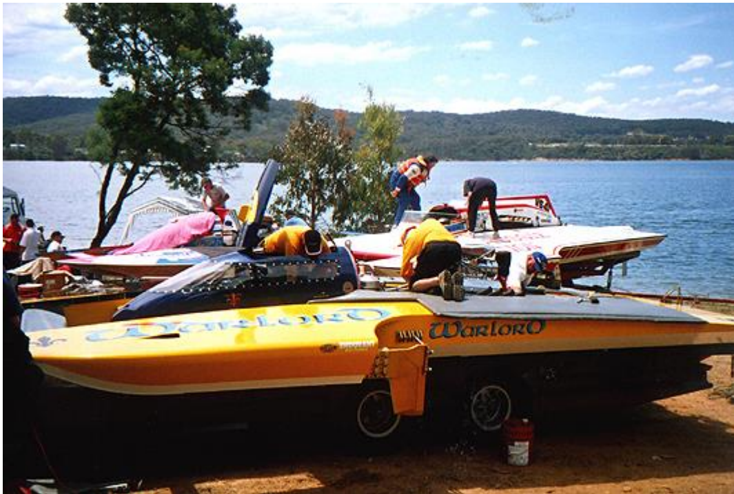
GP's in the PITS